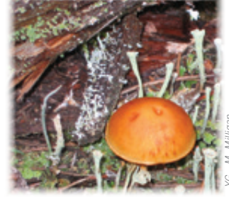
A mushroom growing on decaying wood.