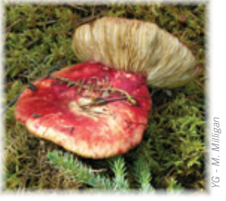
Russulas can be found on woodland soil and leaf litter.

The fun in mushroom viewing is learning the habits of your favourite mushrooms, like the migration patterns of a bird. Sometimes you may only have a window of a few days to see them!