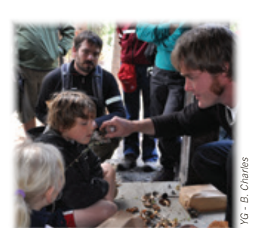
It's good practice to find a mushroom identification buddy with whom you can compare notes and seek a second opinion. You might see a mushroom as a rustyred colour while your partner sees it as a brownish-orange colour, which may change how you identify it.

There are thousands of species of mushrooms in Yukon that even experts have difficulty identifying. Consider focusing on just three or four common mushrooms without trying to identify every fungus you find.