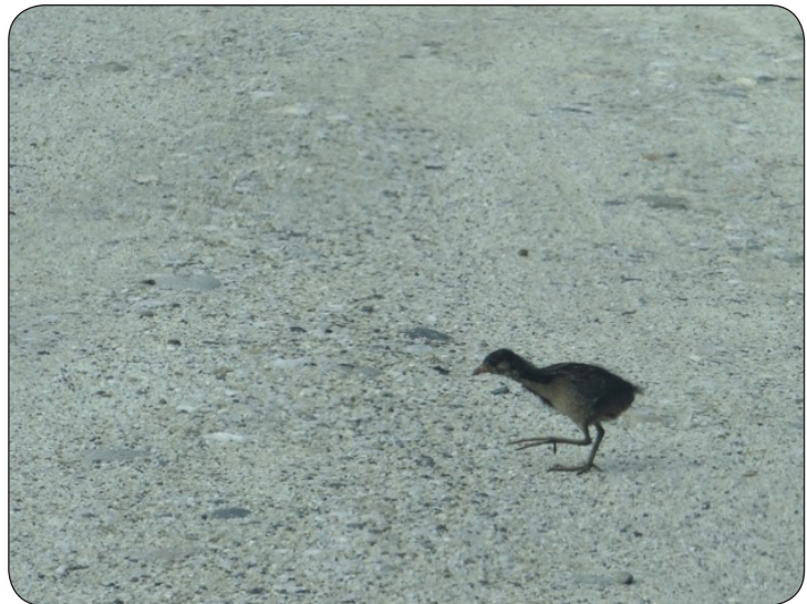
Sora Rail chick.