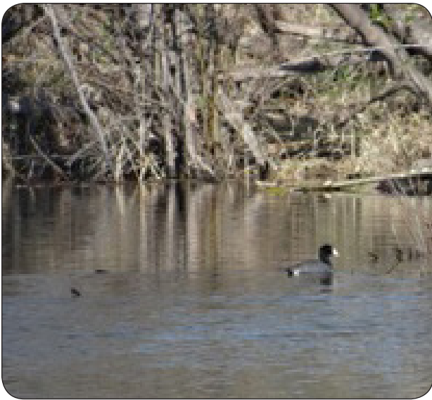
American Coot spotted in Dawson area.