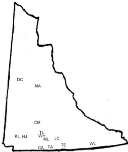
Figure 1. Locations of CBCs

There was an excellent turn-out to the annual Christmas Bird Counts in Yukon with counts being conducted in 13 locations in 2013. The data from these counts have been posted to the Audubon Society's website , the official sponsor of the Christmas Bird Count throughout North America. This article summarizes the information collected from all 13 Yukon Christmas Bird Counts in 2013 by field observers. A total of 7932 birds comprising 40 species were counted by 114 participants during the period December 15 – January 6. The location of the counts is shown in Figure 1 and the counts are summarized in Tables 1-3.