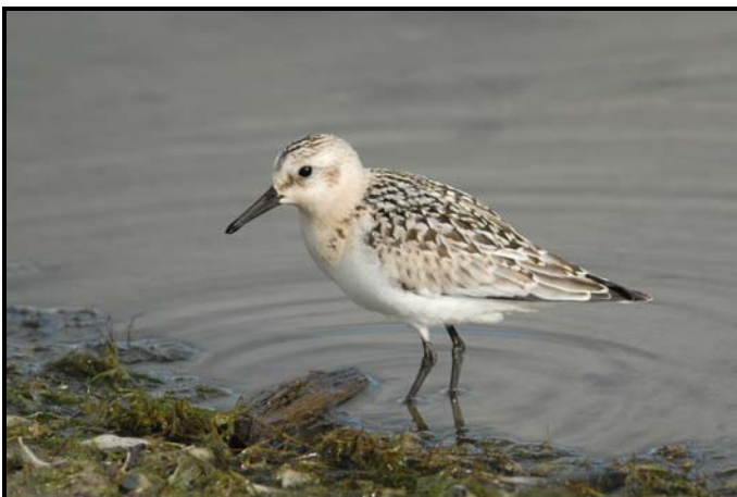
While Sanderling is an uncommon migrant in southern Yukon, it is regularly seen in fall at the Whitehorse Sewage Ponds; this individual was photographed there 29 August 2007.