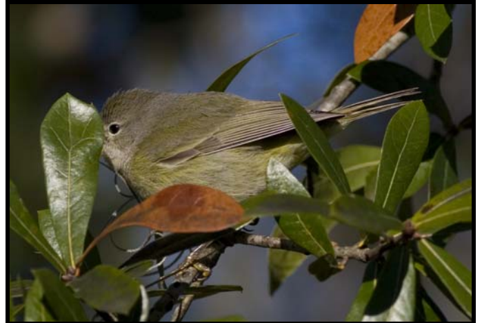
Not taken in the Yukon, but a Yukon species.