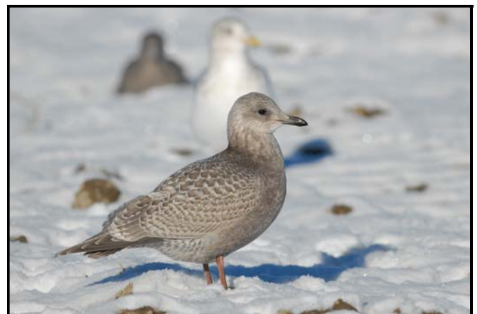
Thayer's Gull is an exceptionally rare in spring in the Yukon but is a fairly common fall migrant; this juvenile was photographed in Whitehorse 24 October 2007.