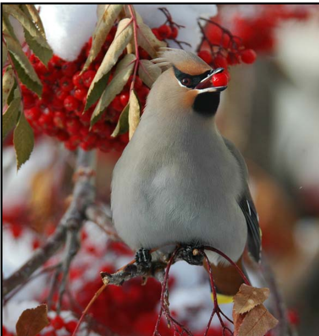
Bohemian Waxwings are an exciting find on Yukon Christmas Bird Counts (Photo: Cameron Eckert).

Date: Sunday, December 14, 2007 Compiler: Elaine Furbish for up to date information please check ( groups.google.com/group/skagway-bird-club )