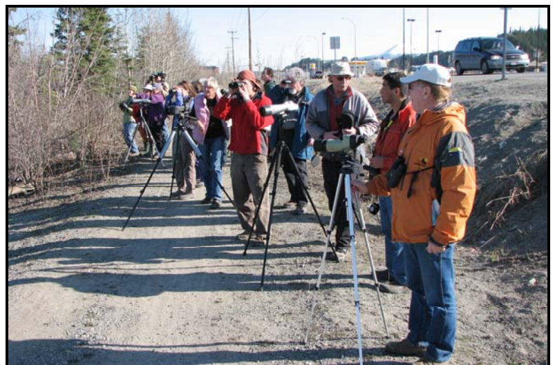
An enthusiastic group of birders take in the avian splendor of the Quartz Road wetland on 8 May 2008.