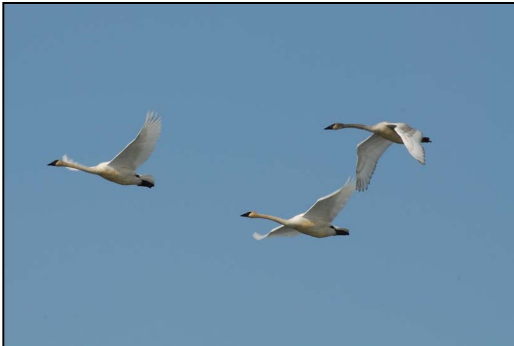
Trumpeter Swan trio, Tagish