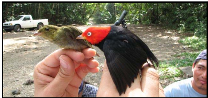
Red-capped Manakins