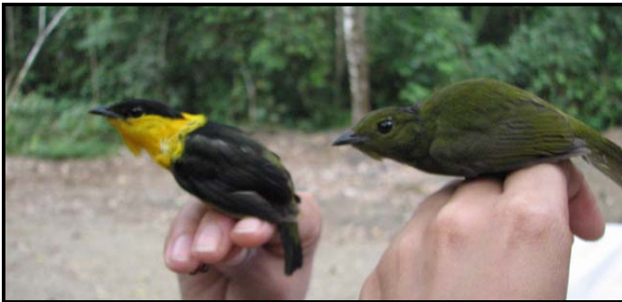
Golden-collared Manakins