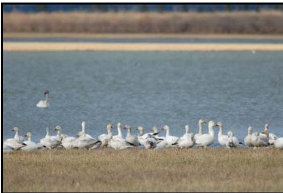
This flock of 156 Snow Geese at Shallow Bay on 13 May 2008 was one of the largest flocks seen in southern Yukon where this species is an uncommon migrant.