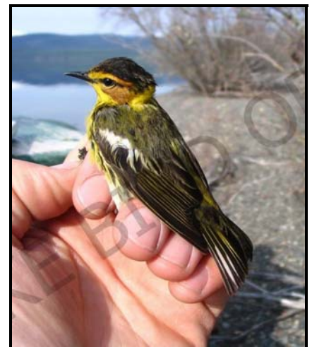
Cape May Warbler

As a whole, the sparrows are typically very well represented during the spring season and this year was no exception. The “Big 3” once again included White-crowned Sparrow, Dark-eyed Junco and American Tree-Sparrow with banding totals of 311, 224 and 41. Sparrows migrate north primarily during the first half of May and this year White-crowned Sparrows peaked with 220 observed on May 6 th . On the same day, over 800 Dark-eyed Juncos were observed and the Bander In Charge stated that it was “raining juncos” as flock after flock few overhead following the lakeshore north. Species such as Fox Sparrow, Lincoln’s Sparrow, Savannah Sparrow and Golden-crowned Sparrow followed suite with the more common species, but at a much smaller magnitude. Lapland Longspurs were also seen in earnest during the first ten days of May with over 650+ observed on May 6 th and 7 th . A small number of individuals were also banded this spring for the first time at