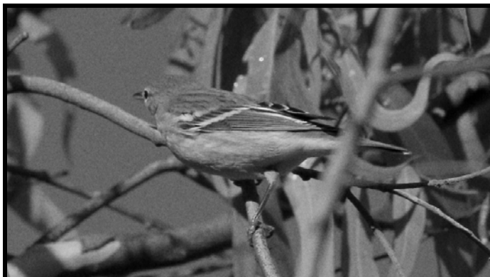
Not taken in the Yukon, but a Yukon species.