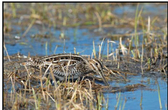
A migrant Wilson's Snipe blends well with the marsh grasses at Shallow Bay on 9 May 2008.