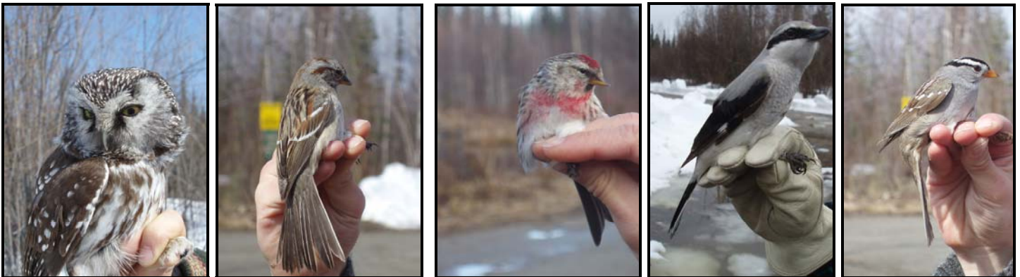
Boreal Owl, American Tree Sparrow, Common Redpoll, Northern Shrike, White-crowned Sparrow