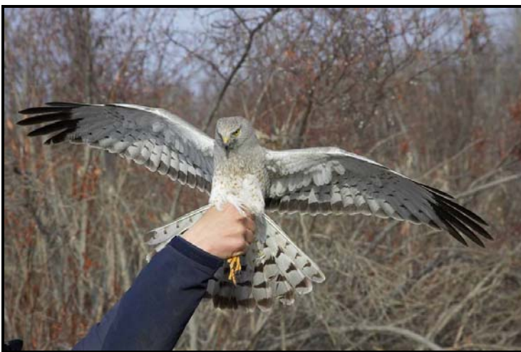
Northern Harrier, May 4 th

Visual migration counts conducted this spring yielded some truly impressive numbers of migrating raptors. The most common raptor observed was Northern Harrier with 270 individuals observed. In addition, one individual was captured and subsequently banded opportunistically on May 4 th . Sharp-shinned Hawks were also quite common with 66 individuals observed and 1 individual banded. Other raptor species seen including Osprey, Bald Eagle, Red-tailed Hawk, Rough-legged Hawk, Golden Eagle, American Kestrel, Merlin and Peregrine Falcon. The most notable raptor observation of the season was a single Swainson's Hawk observed in migration on May 4 th .