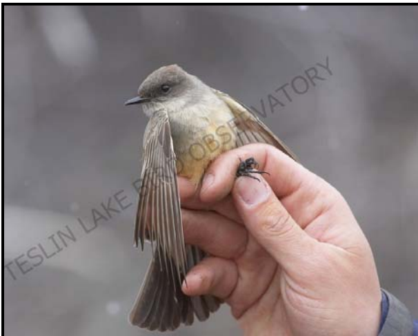
Say's Phoebe

Northern Flicker was the most common woodpecker observed this spring with up to 5 individuals seen daily throughout much of the season. The lone woodpecker banded was a male Yellow-bellied Sapsucker on May 8 th . Once again this spring, the flycatchers were well represented with Hammond's Flycatcher being the most common with 18 banded. The Olive-sided Flycatcher, recently listed by COSEWIC as "threatened" was seen in good numbers with 6 banded including 5 individuals on May 18 th . Other flycatchers banded this spring included Alder Flycatcher, Least Flycatcher and Say's Phoebe (Western Wood-Pewee also observed but not banded). Horned Larks were not very common this year and were observed on three days with a high count of 77 in migration on May 3 rd . The first swallows seen this spring included a pair of Cliff Swallows and 4 Tree Swallows on May 6 th . A season high 87 Tree Swallows were seen in migration on May 17 th . Both Bank Swallow and Violet-green Swallow were also seen this spring. Ever present at the station once again this spring, both Black-capped and Boreal Chickadees were seen daily with up to 4 individuals of each species seen daily. A pair of Mountain Chickadees banded on May 2 nd were an exciting capture.