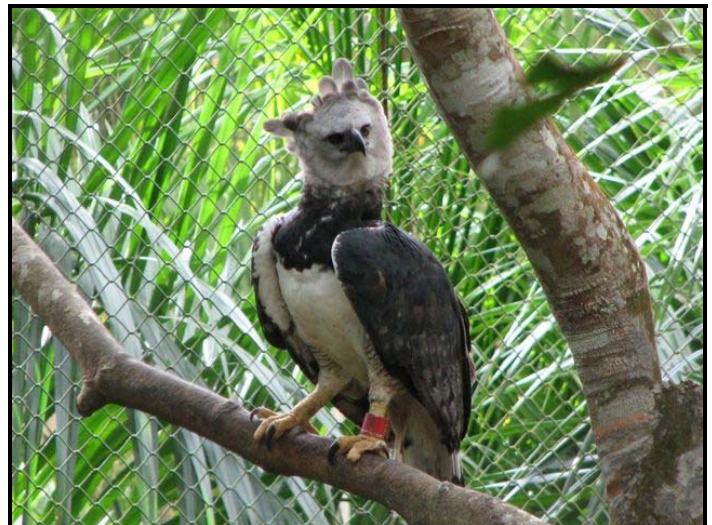
Harpy Eagle