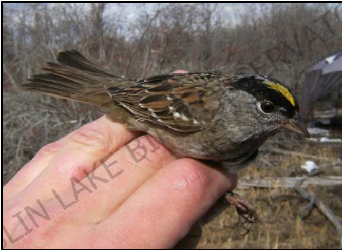
Golden-crowned Sparrow