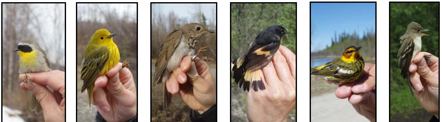
Common Yellowthroat, Yellow Warbler, Gray-cheeked Thrush, American Redstart, Cape May Warbler, Alder Flycatcher