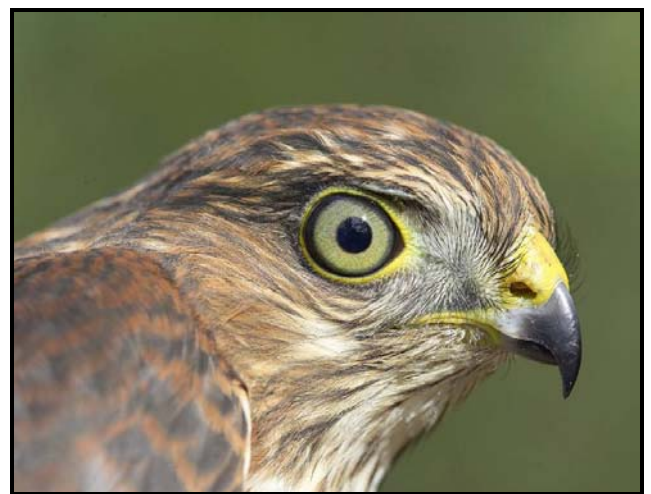
Sharp-shinned Hawk, May 3 rd