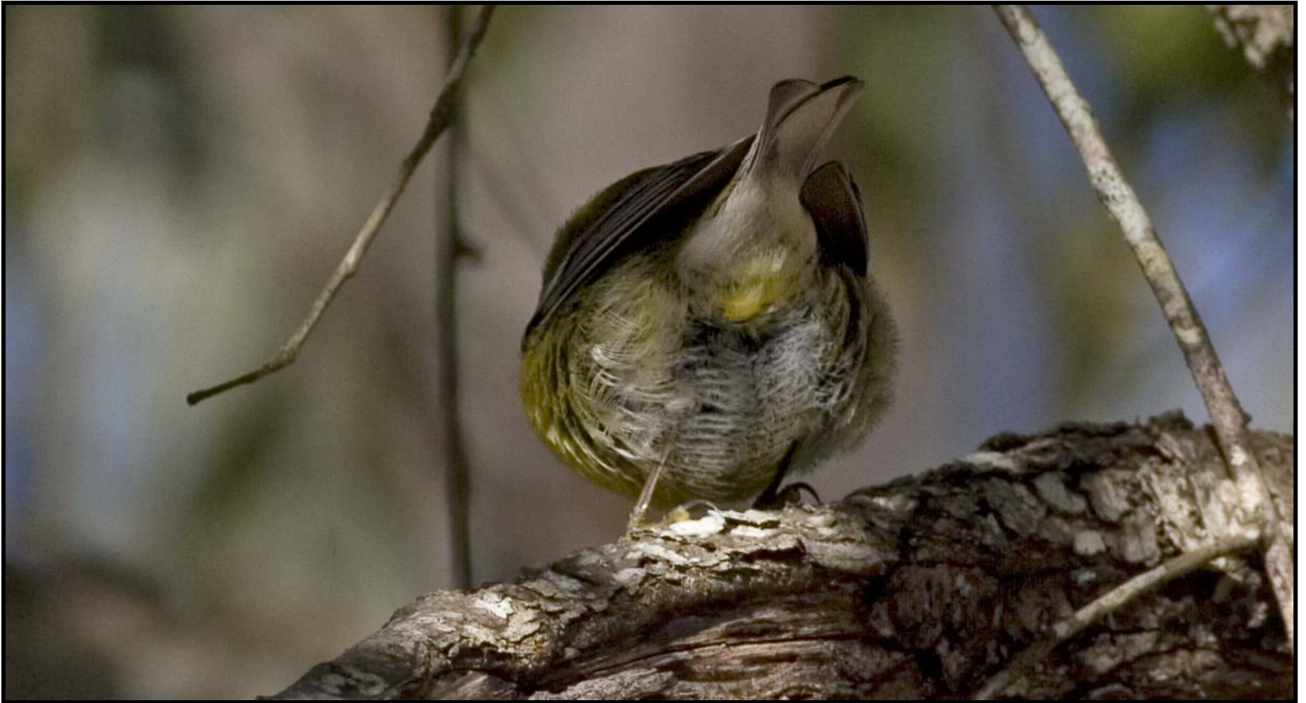
May or may not be a Yukon species, Photo: M. Boothroyd