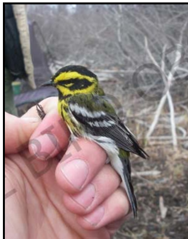
Townsend’s Warbler, Photo: TLBO