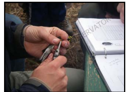
Banding a Townsend's Warbler