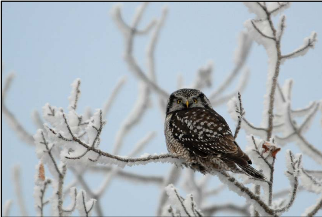
A Northern Hawk Owl marks the start of the winter season on December 1 at Lake Laberge, s. Yukon.