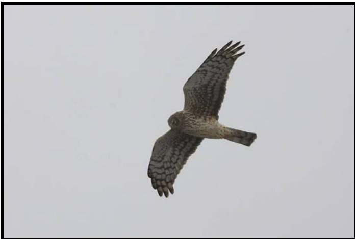
Teslin Lake, May 2008