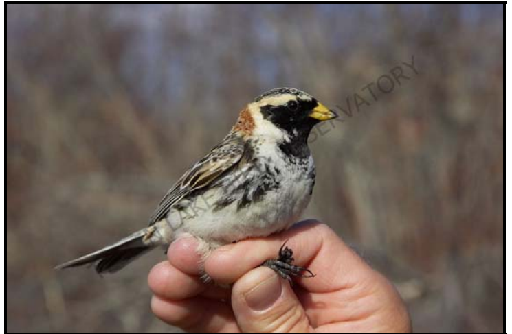
Lapland Longspur

This spring was somewhat disappointing for Rusty Blackbirds as none were banded; however, a number were observed in migration including a high count of 125 on May 7 th . Other blackbird species seen in low numbers included Red-winged Blackbird and Brown-headed Cowbird. In regards to finches, the Common Redpoll was another ever present migrant during early May. Over 150 were observed daily from May 1 st to 7 th and total of 22 were banded. Other finch species encountered included Red Crossbill, Purple Finch and Pine Siskin.