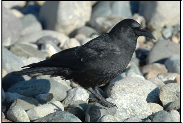
American or Northwestern -- you be the judge. While American Crows nested in the Yukon this summer, the identification of these individuals in Whitehorse 4 & 11 Oct hardly seemed straightforward.