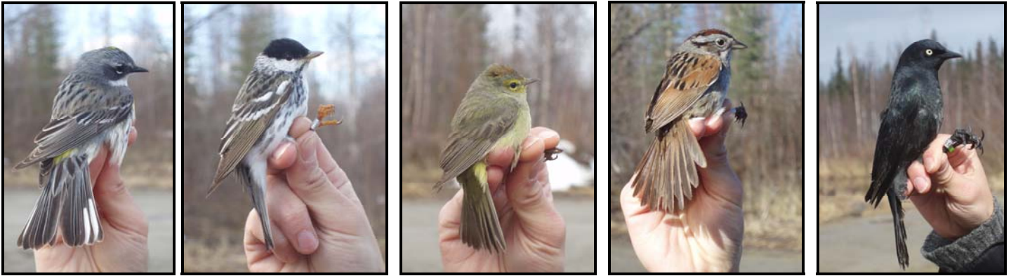
Yellow-rumped Warbler, Blackpoll Warbler, Orange-crowned Warbler, Swamp Sparrow, Rusty Blackbird

to the growing list of migrants. By the 13 th , the sparrows were thinning out and the marsh was taken over by the much awaited neotropical songbirds.