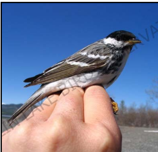
Blackpoll Warbler, Photo: TLBO

Due to the relatively late “green-up” of the study site due to the close proximity to Teslin Lake (which remains frozen until late May), many of the late migrating warblers are not seen at the observatory in high numbers during the spring. Despite this, a number of species were observed although the number of individuals was not very high. One species, Wilson’s Warbler, was encountered in fairly substantial numbers with a banding total of 151 including a fallout of 90 banded on May 18 th . Yellow-rumped Warbler was the second most common warbler species with 78 banded including a high daily banding total of 14 on May 7 th . Additional species including Blackpoll Warbler, Yellow Warbler, Common Yellowthroat and Northern Waterthrush were seen in low to moderate numbers during the last half of May; however, there were no notable movements during this time. A male Townsend’s Warbler banded on May 18 th was a first for the observatory and made a timely appearance for a number of visitors. Perhaps the most notable capture this spring was a male Cape May Warbler banded on May 31 st .