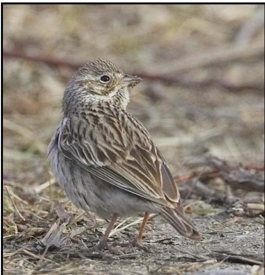
The Yukon's second confirmed record of a Vesper Sparrow, this individual touched down briefly at Albert Creek on 16 May 2008 following two days of strong southeast wind