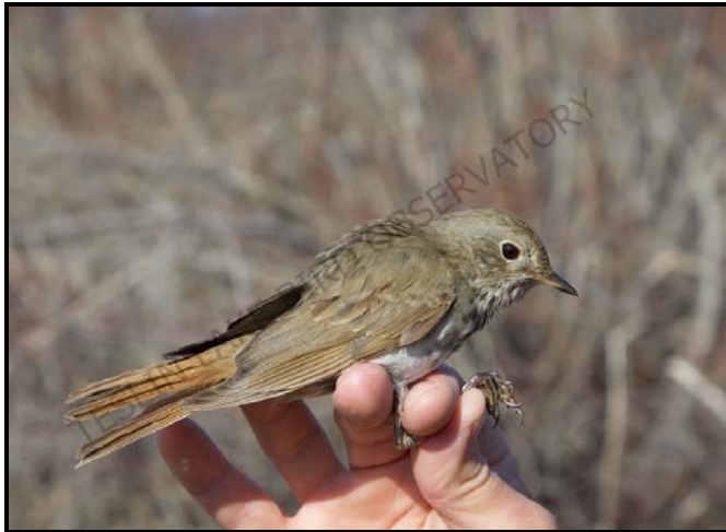
Hermit Thrush