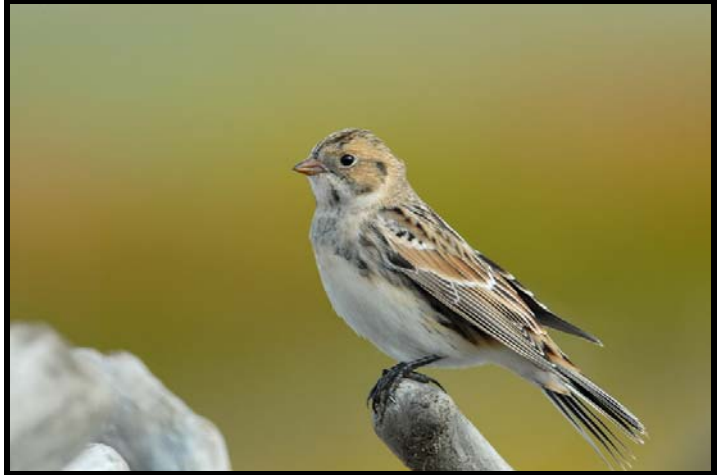
Herschel Island, 20 Aug 07, Photo: Cameron D. Eckert