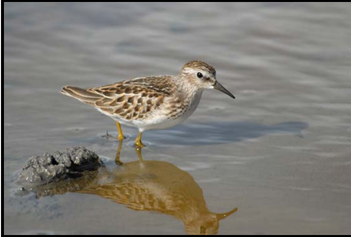
Whitehorse Sewage Ponds, 15 Sept 07, Photo: Cameron D. Eckert

Time to test your bird identification skills ! A rationale for the identification will be provided in the next edition of The Warbler . The goal is to provide a variety of difficult levels and if you have suitable (difficult) photos for future challenges, please email the newsletter editor. Good Luck !