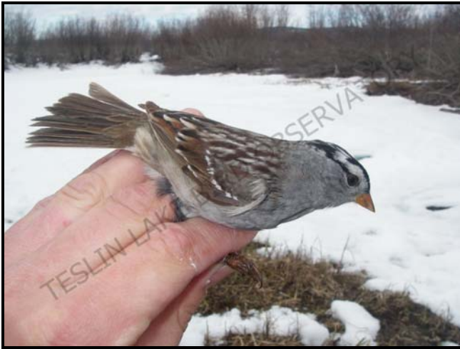
White-crowned Sparrow

the observatory. The late migrating Chipping Sparrow was added to the species list during the final days of May when 2 individuals were banded.