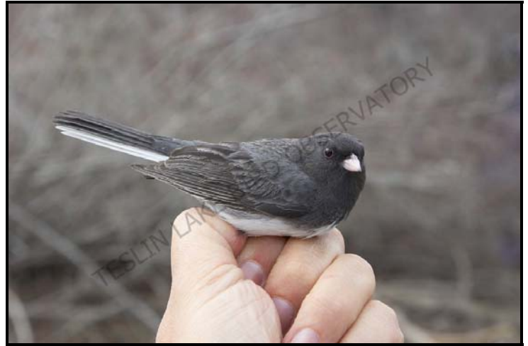
Dark-eyed Junco