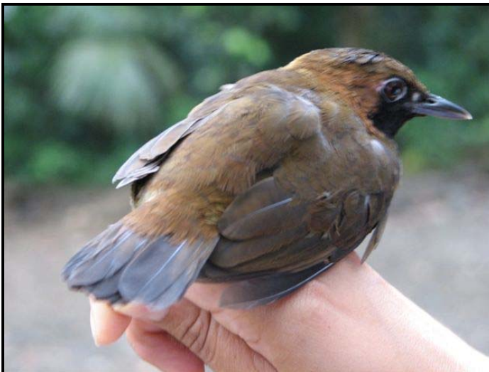
Bi-colored Antbird