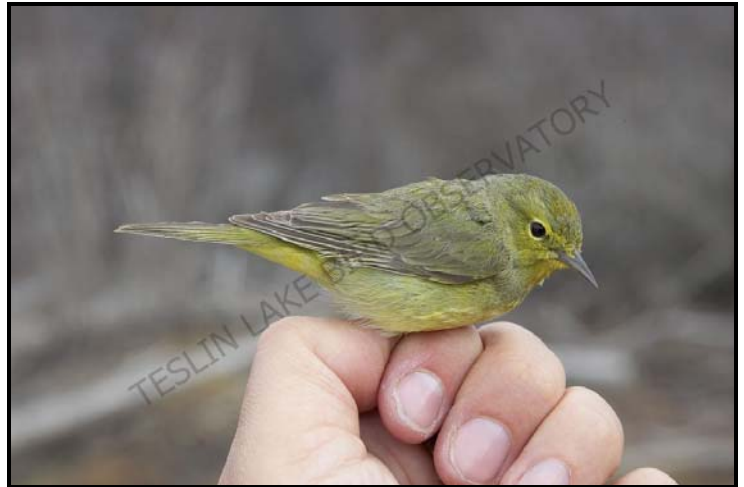
Orange-crowned Warbler

Due to the relatively late “green-up” of the study site due to the close proximity to Teslin Lake (which remains frozen until late May), many of the late migrating warblers are not seen at the observatory in high numbers during the spring. Despite this, a number of species were observed although the number of individuals was not very high. One species, Wilson’s Warbler, was encountered in fairly substantial numbers with a banding total of 151 including a fallout of 90 banded on May 18 th . Yellow-rumped Warbler was the second most common warbler species with 78 banded including a high daily banding total of 14 on May 7 th . Additional species including Blackpoll Warbler, Yellow Warbler, Common Yellowthroat and Northern Waterthrush were seen in low to moderate numbers during the last half of May; however, there were no notable movements during this time. A male Townsend’s Warbler banded on May 18 th was a first for the observatory and made a timely appearance for a number of visitors. Perhaps the most notable capture this spring was a male Cape May Warbler banded on May 31 st .