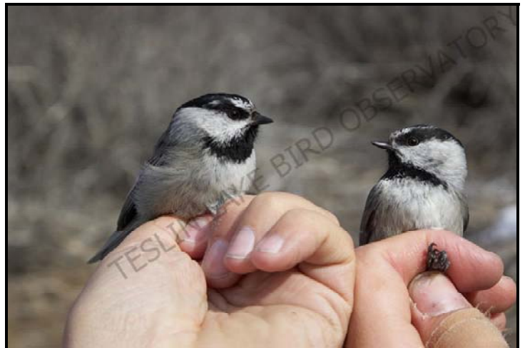
Mountain Chickadees