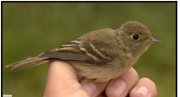
Teslin Lake, August 2008