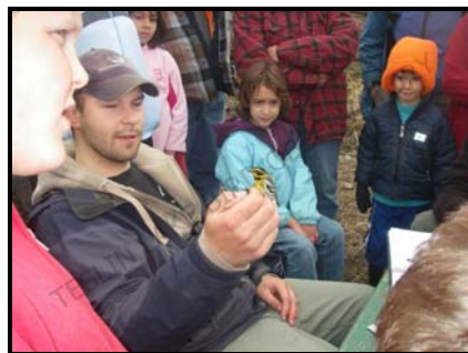
Giving a banding demonstration