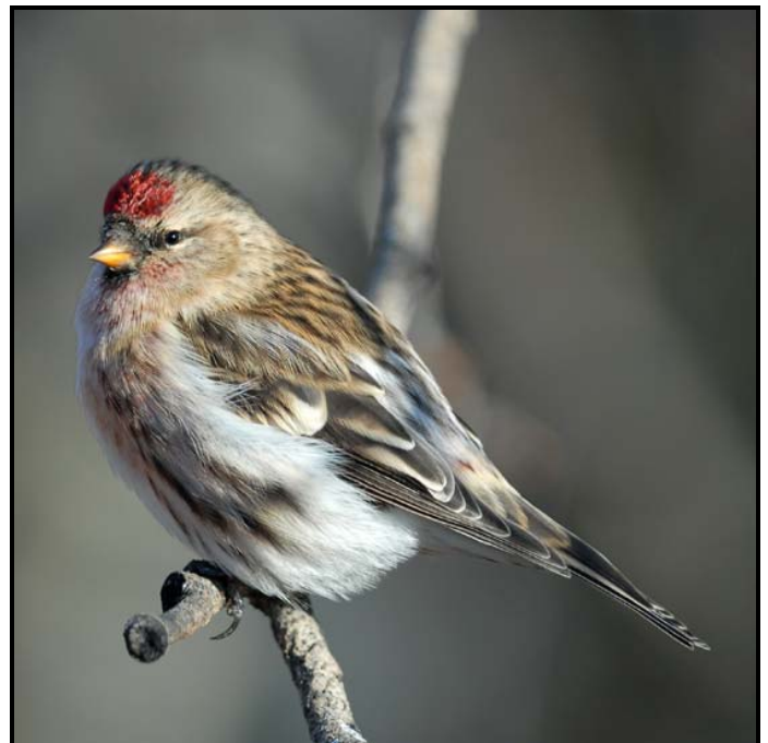
Common Redpolls are often one of the most abundant bird species encountered on Yukon Christmas Bird Counts.