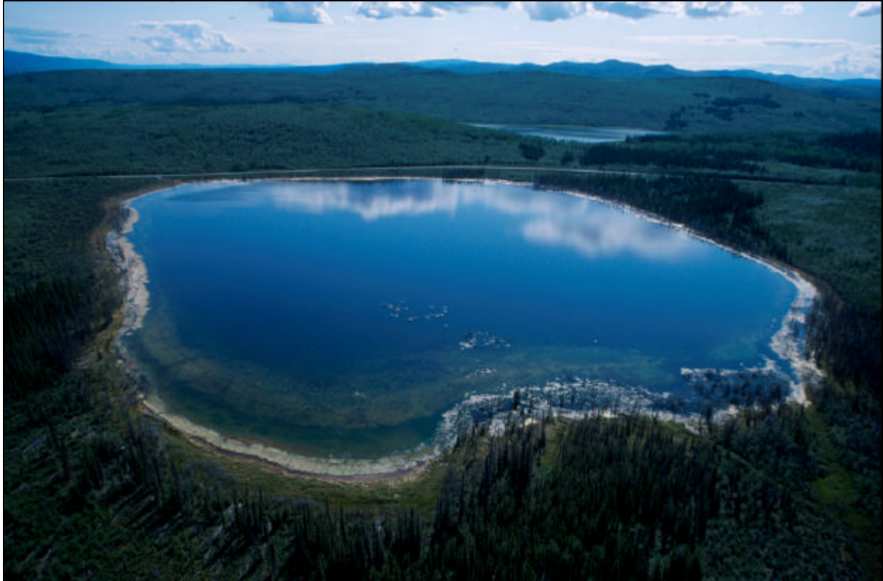
Coot Lake, 8 km south of Pelly Crossing, is a well-known Yukon location for American Coot, Gadwall, and Ruddy Duck. August 3, 2001.

A n Upland Sandpiper was seen on the Rodeo Grounds by the Klondike Highway northwest of Whitehorse on June 12 (BD,HG). Five Wilson's Phalaropes were observed at Swan Lake on June 1 (BD,HG). A Short-eared Owl at Swan Lake near Whitehorse on June 1 raised the possibility of local breeding (BD,HG); another was seen over alpine tundra near Wolf Lake in southeast Yukon on June 20 (CE). Eight Boreal Owls , often calling during the day, were heard by numerous observers in June: one was calling at Silver Creek, southwestern Yukon on June 7-8 (MG); one was heard at Sulphur Creek, Kluane National Park on June 8 (MG,SG); one was at the Nisutlin Bay Marina on June 10-20 (MG,SV); one was calling at Hayes Creek near Teslin (CE); one was heard at Hermit Lake near Teslin on June 26 (MG,SV); and three were heard at Mt. McIntyre on June 8, 12 & 14 (HG,DF,LF,CH,KH).