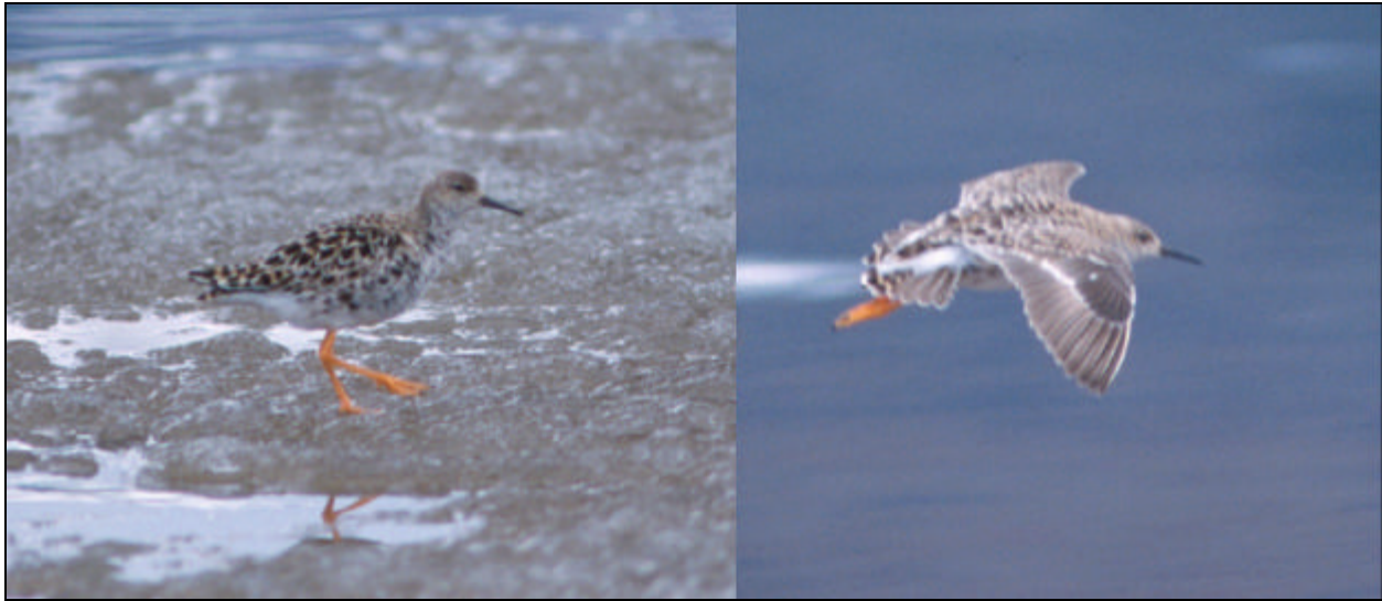
The Yukon's first Ruff at Lewes Marsh on 19 May 2002.

A good season for owls produced many reports of calling Great Horned and Boreal Owls . Seven Great Horneds and six Boreals were heard during 20 stops along the Atlin Lake Road, Yukon, and five Great Horneds and five Boreals were calling north of Jake's Corner during 15 stops on April 15 (JJ); a few nights earlier, one Great Horned and eight Boreals were observed along the Tagish Road. Six Great Horneds and three Boreals were between Swan Haven and the Carcross Corner (JJ). Ten Great Horneds and 6 Boreals were counted between Squanga Lake and Jake's Corner on April 24 (MG). Five Great Horneds and three Boreals were at Swan Lake, north of Whitehorse on May 21 (HG). Single Boreals were heard at the Takhini River Road on March 9 (BD), at the Kusawa Lake Road on March 11 (BD), at Wolf Creek on March 16 (MG), at Minto Lake on March 29-31 (MO'D), at Joe Creek near Teslin on March 29 (MG), at the Fish Lake Road on April 6 (MG), at M'Clintock River on April 24 (MG), and at Silver Creek, southwestern Yukon on May 16 and 18 (MG,AH). These records add up to an amazing 34 Great Horned and 39 Boreal Owls .