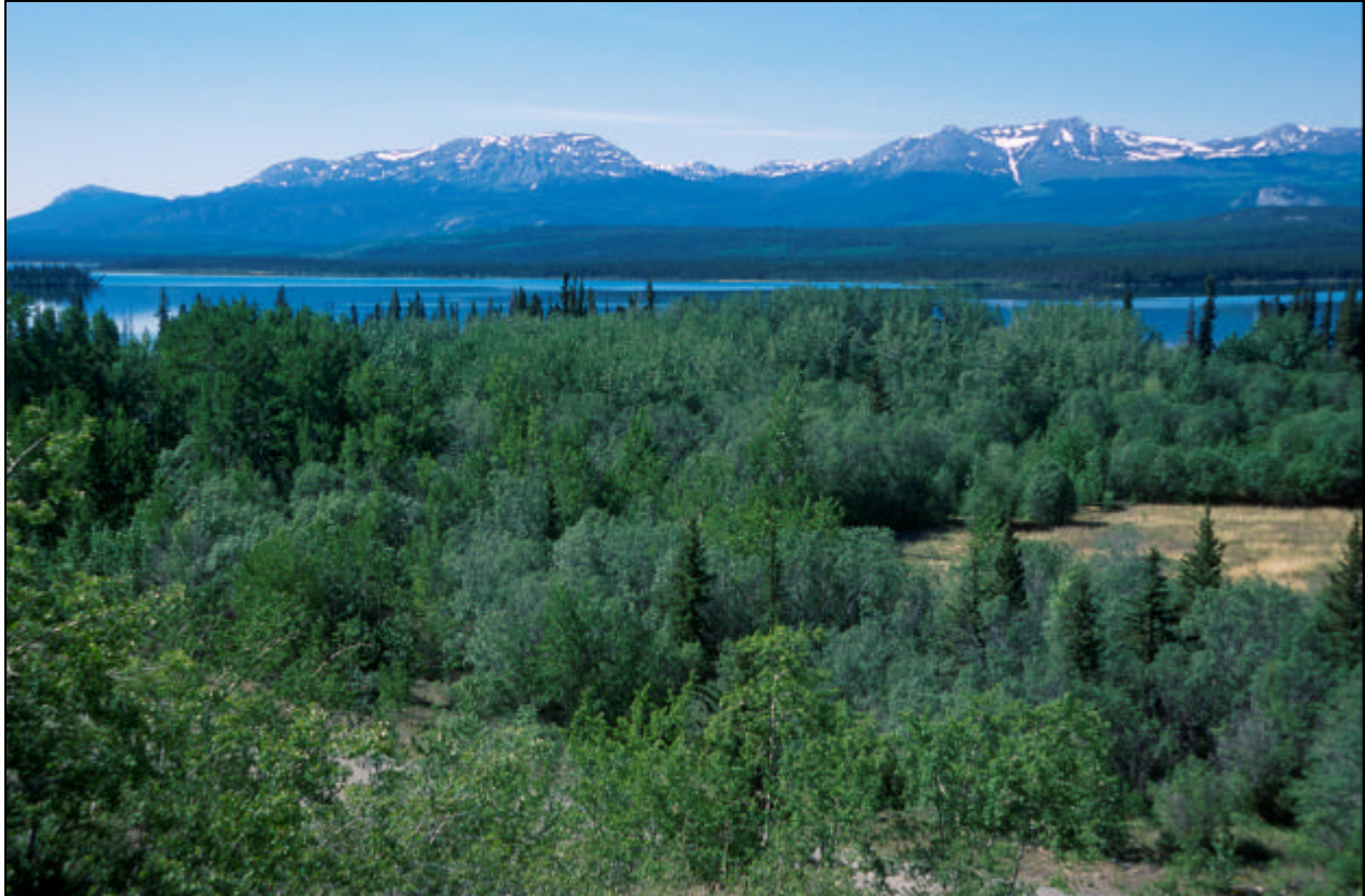
An abundance of deciduous habitat at Haunka Creek makes this an ideal location for vireos and warblers. June 14, 2002.

A closely observed and well-documented male Siberian Blue Robin foraged in a Dawson resident's garden on June 8 (NC,AS); this established not only a first Yukon record, but also a first for mainland North America. A Cedar Waxwing was at Upper Liard on July 18 (HG). A Tennessee Warbler was heard near Teslin on June 17 (CE,MG), and 12 were at the Albert Creek Road near Upper Liard on June 23 (HG). Two Magnolia Warblers were at the Albert Creek Road on June 23 (HG). A male and one or two female Cape May Warblers at the Albert Creek Road on July 7 provided the Yukon's westernmost record (HG,TMK). They were repeatedly seen with caterpillars and moths in their bill suggesting breeding nearby. Townsend's Warblers were noted in good numbers at a few locations near Teslin during June surveys (MG); elsewhere, two were at White Mountain on June 7 (BD,YS,HG). Five American Redstarts were at Haunka Creek on June 7 (BD,YS,HG); seven were on the Albert Creek Road on June 23 (HG). Three Western Tanagers were at their usual location at the Albert Creek Road on June 23 (HG). A count of 40 American Tree , 20 Savannah , and 20 Golden-crowned Sparrows was made in the alpine above Wolf Lake in southeastern Yukon on June 20 (CE). Two Snow Buntings were singing and calling and appeared to be quite agitated by the presence of the observers as if they were near a nest on a 2100 metre peak in the Ruby Range near Kluane Lake on June 30 (MW,HW).