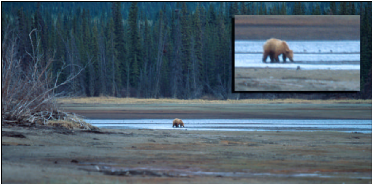
Up to two Grizzly Bears at Judas Creek (one seen here on May 23, 2002) curtailed birding there through May.