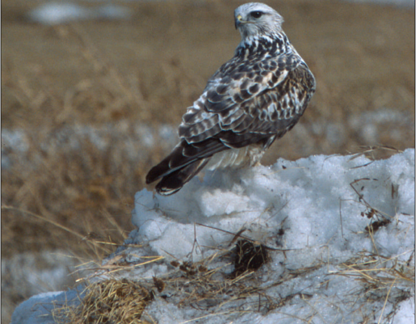
Rough-legged Hawk on migration in Whitehorse, April 18, 2002.

Newsletter of the Yukon Bird Club - Fall 2002