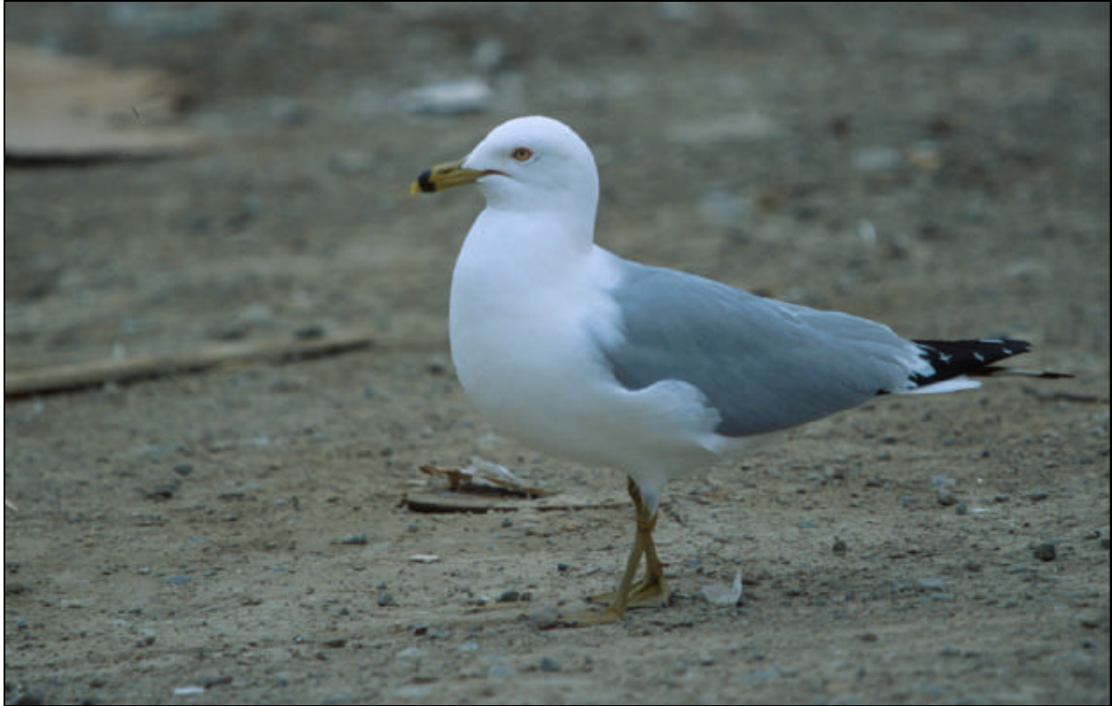
An adult Ring-billed Gull at the Whitehorse landfill on May 11, 2002.

Lake on March 10 (TMK), and the first spring flock of four was seen in the Mayo area at the Minto Burn on March 19 (MO'D). Flocks of 500 and 100, respectively, were still moving up the Alaska Highway at Irons Creek on May 15 (HG). Stiff north winds grounded a few migrant Smith's Longspurs with four at Tagish on May 17 (JJ,ARou), one at Shallow Bay on May 19 (CE), and one at Army Beach on May 19 (JJ,ARou). A female-type Evening Grosbeak continued to visit a feeder at Riverdale in Whitehorse through March (RE).