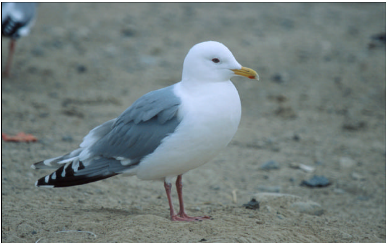
Extremely rare in spring was this "classic" adult Thayer's Gull in Whitehorse on May 9, 2002. Its small bill, short legs and distinctive wing tips easily differentiate it from a Herring Gull.

Rare shorebirds included a Ruddy Turnstone at Army Beach, Marsh Lake on May 22 (JJ), single White-rumped Sandpipers at Lake Laberge on May 25 (JJ), at Lewes Marsh on May 26 (JJ), and at Judas Creek on May 28 (JJ,ARou), a Stilt Sandpiper at Lewes Marsh on May 23-24 (JJ,ARou), a Buff-breasted Sandpiper at Shallow Bay on May 24 (CE), and likely the same bird at Lake Laberge on May 25 (JJ), and the Yukon's first Ruff , a female, at Lewes Marsh on May 19 (JJ,ARou, many observers). Rare gulls at the Whitehorse landfill included a Ring-billed Gull on May 11 and an adult Thayer's Gull on May 9 (CE). About six individual Glaucous-winged Gulls were noted in Whitehorse from late April on (CE;JJ).