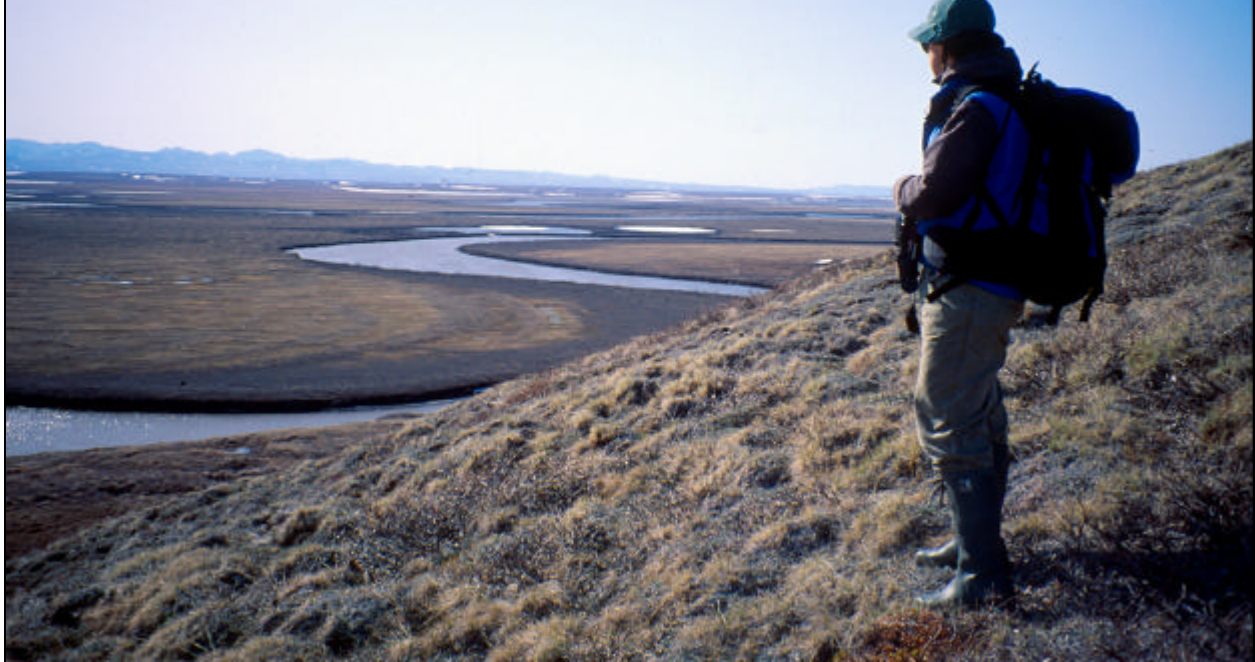
Babbage River, June 1993.