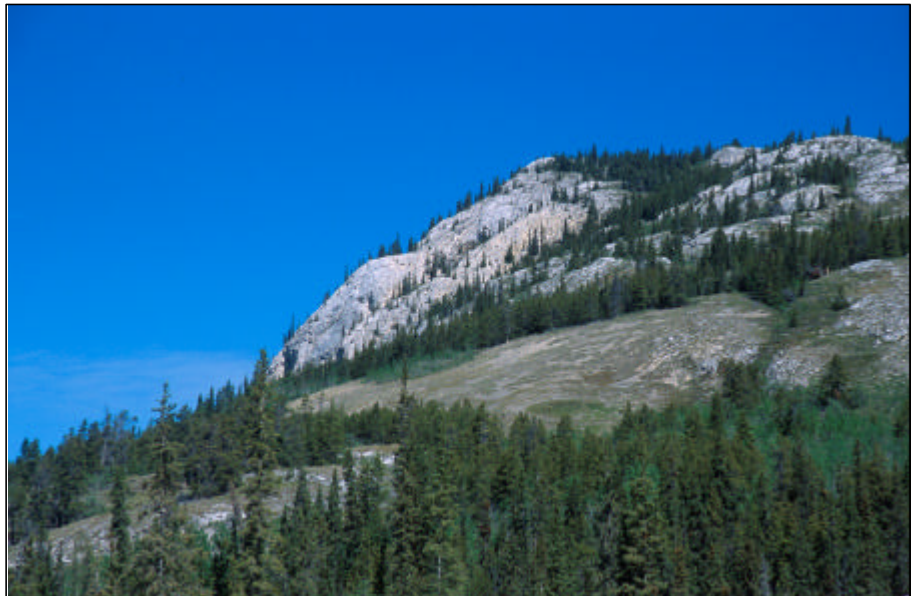
White Mountain, June 14, 2002.