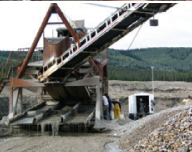
Top: Fossil woolly mammoth tooth found at Quartz Creek. Centre: A well preserved fossil horse skull from Quartz Creek. Bottom: Gimlex Mine Sluice plant on the Indian River.