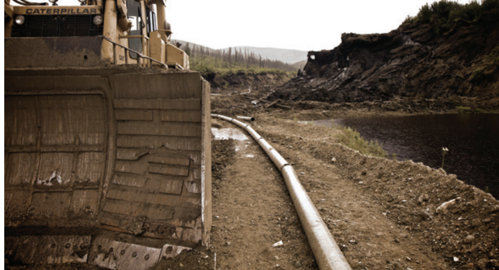
Bulldozer used to strip ground in the Klondike Goldfields.