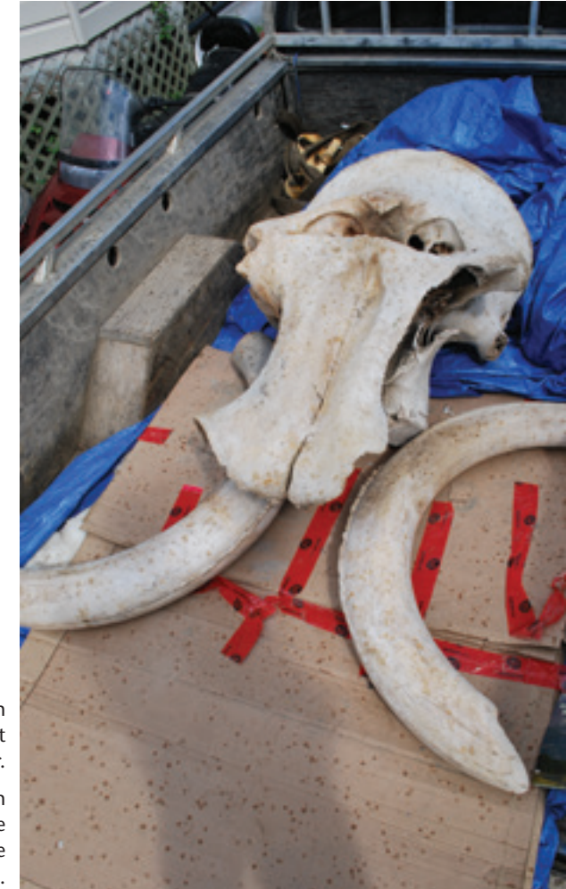
Right: Fossil woolly mammoth skull and tusks found at Hawk Mine on Sixtymile River.