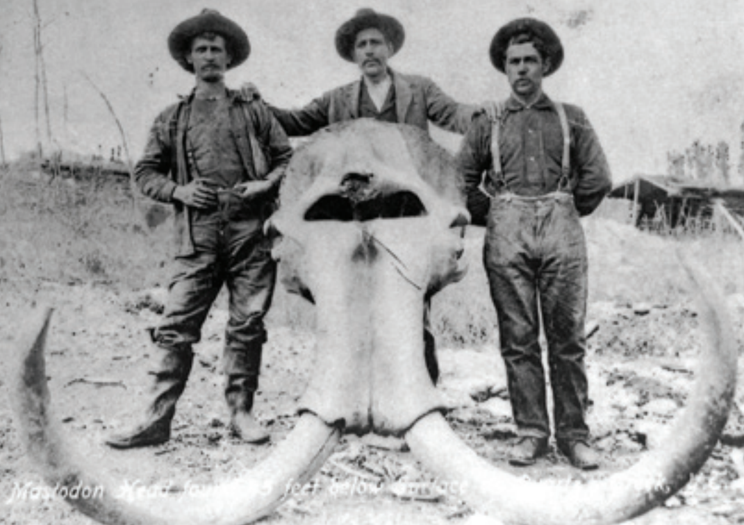
Klondike miners in 1904 with woolly mammoth skull.