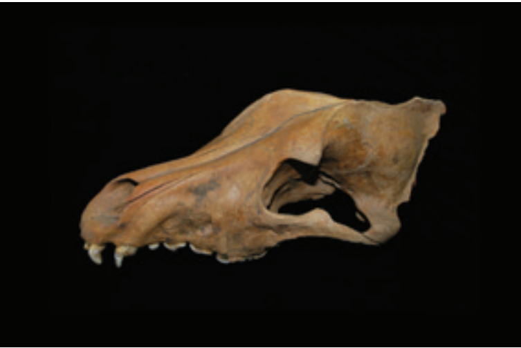
Left: Fossil ice age wolf skull in the Government of Yukon Palaeontology Collections.