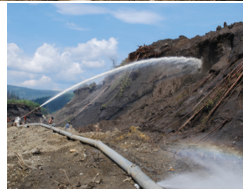
Hydraulic monitoring to remove black muck at Quartz Creek.

Many placer mines in Yukon face the problem of removing the thick, frozen black muck overburden that overlies the gold bearing gravel at many creeks. This black muck and other sediment accumulated in valleys during the ice age, and is of great interest to scientists. Many of the ice age bones found at placer mines are recovered near the contact between the black muck and underlying stream gravel. Stripping with heavy machinery or hydraulic "monitoring" are still the principal ways to remove the frozen overburden to recover gold bearing gravel for sluicing. Stripping, trenching or any other method that disturbs the black muck and gravel has a high potential to disturb ice age fossils. By far, hydraulic monitoring is the best method to ensure the recovery of ice age fossils during placer mining activity.