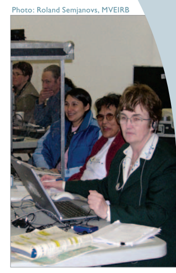
Translators and transcribers at Norman Wells public hearings on MGP

Board members participated in 18 board meetings and 15 teleconferences during the fiscal year. The meetings were held to discuss the full schedule of environmental assessments that the Review Board had to deal with. Several of the Board meetings were held in conjunction with public hearings, which the Board held over the course of the year. The Review Board held its March meeting in Deline and hosted a community open house in conjunction with this meeting.