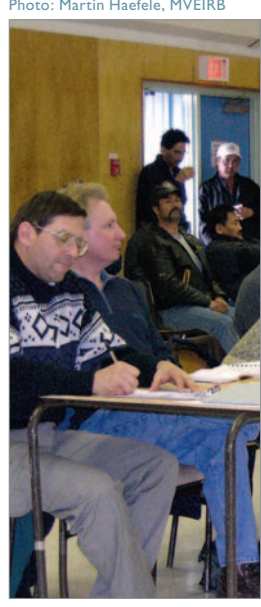
Public Hearing on Northrock Summit Creek exploration well in Tulita