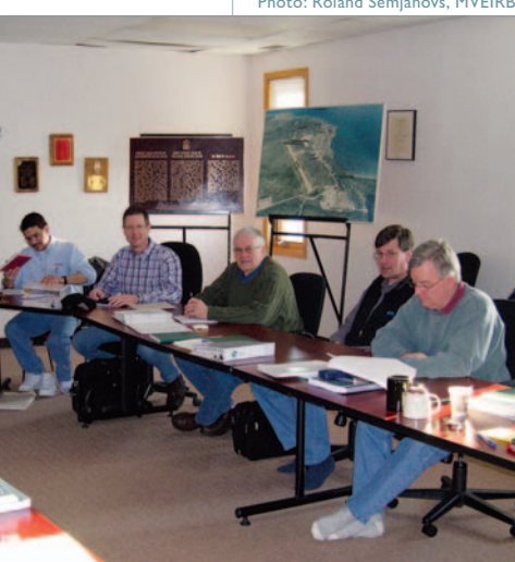
Board members and legal counsel in Deline