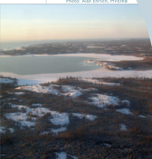
Drybones Bay on Great Slave Lake