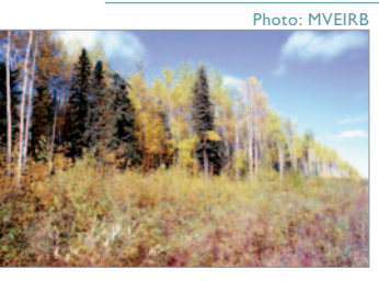
Along the Liard Highway