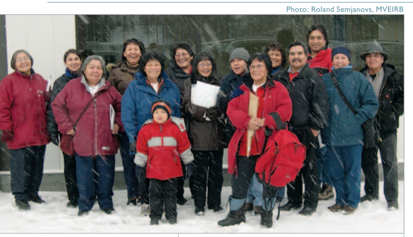
Translators Workshop participants

where New Shoshoni Ventures and North American General Resources projects were also reviewed. As part of this joint assessment, the Review Board contracted a cumulative effects study of the Wool Bay and Drybones Bay areas to bring information before the Board.