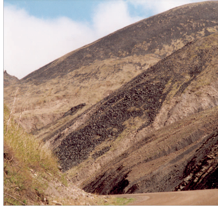
Along the Dempster Highway south of Fort McPherson