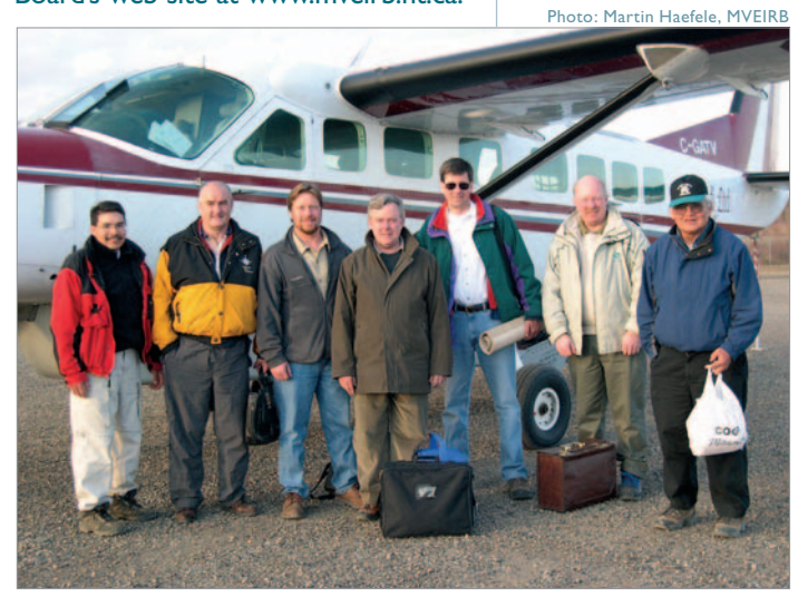
Board Members, legal counsel and executive director at Tulita airport

The various documents referenced here are available on the Review Board's web site at www.mveirb.nt.ca.