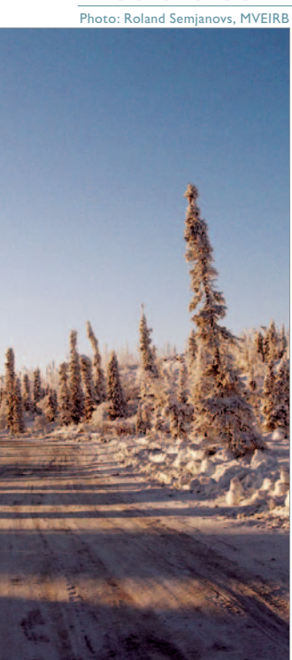
Tibbet to Contwoyto winter road at portage 34

were reviewed. The public hearing for the Snowfield Development Corporation's project followed in Yellowknife on January 13, 2004.