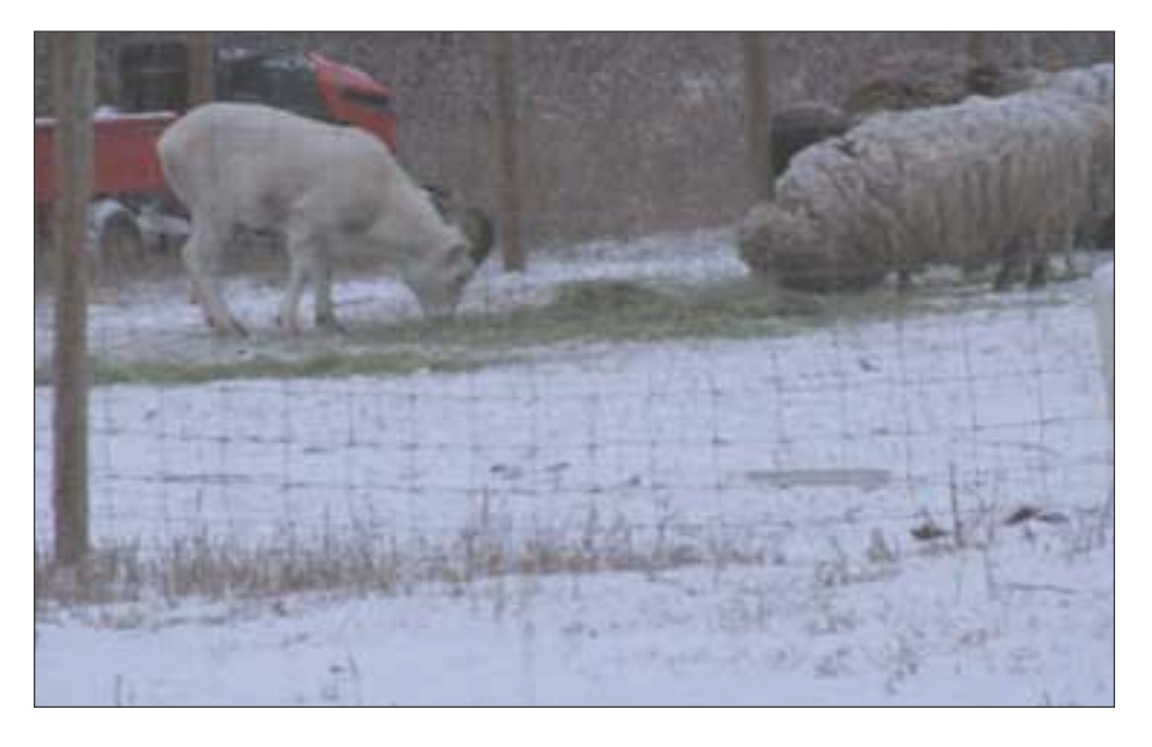
Wild sheep in pen with domestic animals in Dawson area.

With the growing agricultural industry in the Yukon, the number of domestic sheep and goats is likely to increase. This may result in the risk of pathogen transmission and disease in wild sheep also increasing. Steps should be put into place to deal with these risks. So far there are no regulations dealing with this issue but there are some awareness documents published by the Department of Environment and can be viewed online. Recommendations to reduce or prevent contact between domestic small ruminants and wild sheep include using electric outrigger fencing or double fencing around areas where domestic animals are kept, using guardian dogs with your herds, and reporting sightings of wild sheep or escape of domestic livestock.