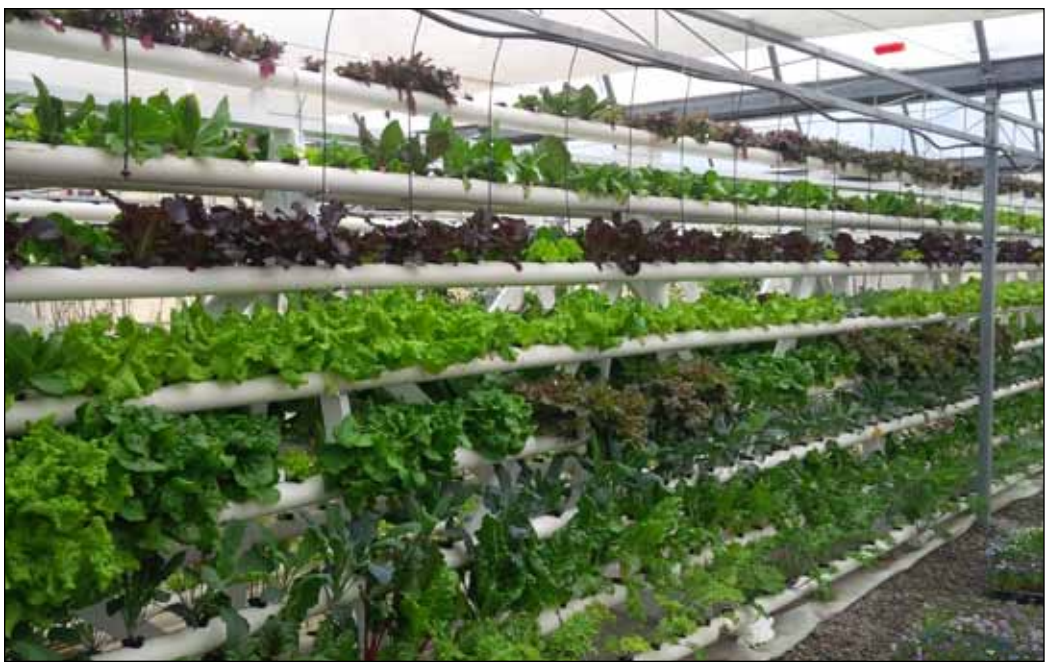
Hydroponic lettuce and kale at Yukon Gardens.

Keep an eye out for Yukon Gardens greenhouse veggies at your next grocery shop, if you want to learn more, Facebook them at @yukongardens or contact them at 867-668-7972 or email ytgardens@klondiker.com.