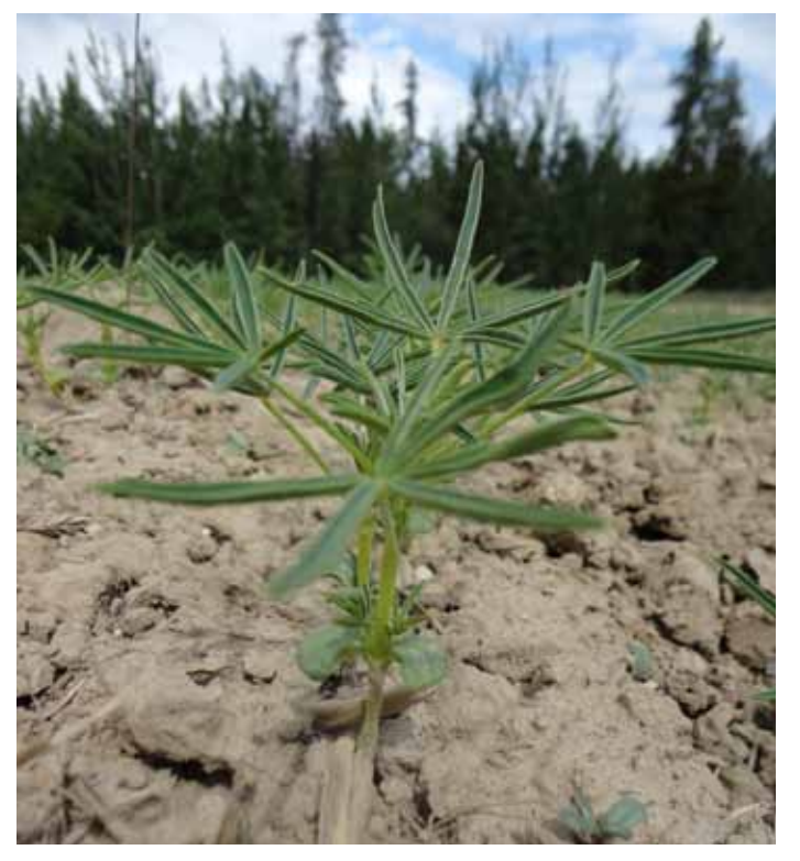
Domesticated feed lupins being grown at the research farm