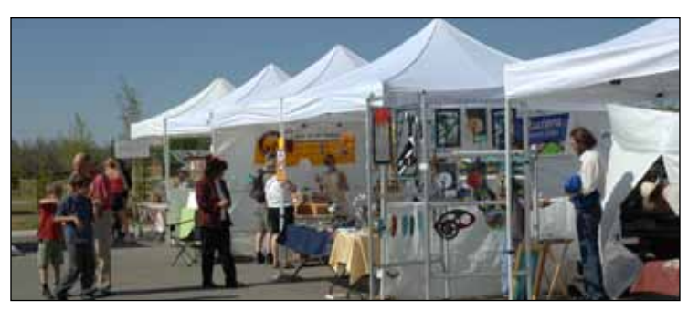
FIREWEED COMMUNITY MARKET

A reminder that YAA has farm equipment to rent: a no-till-drill, an aerator, a manure spreader, a mower and a plough are available at non-profit rates by prearranging pickup and drop off at the office. Proof of insurance for transporting is required.