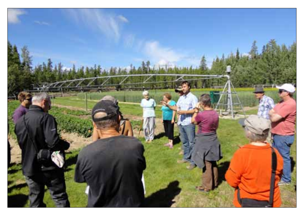
AGRICULTURE DEMONSTRATION DAY DATE: WEDNESDAY AUG 6, 2014.

Also as part of the Yukon Livestock Health Program, the Yukon government has published a poultry health handbook. You can pick up a printed version from the Agriculture Branch office in Whitehorse or view/download it online at http://www.emr.gov.yk.ca/agriculture/pdf/Poultry_Health_Handbook_final.pdf