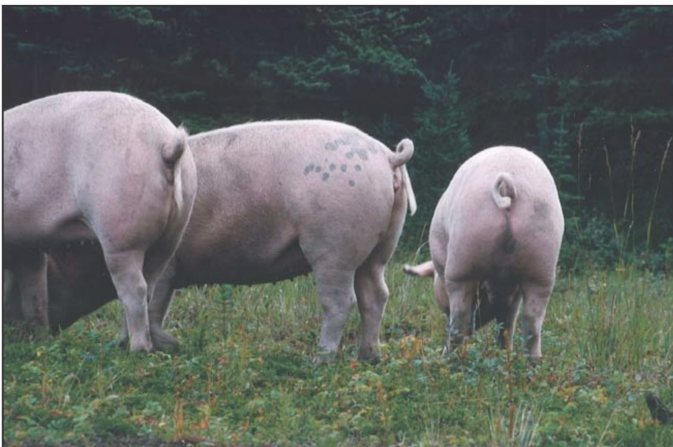
Left: Photo Contest, honorable mention, Sharon Kempton, grazing pigs

The guidelines outline the standards for land development, including the initial clearing of land, the management of lumber, the management of topsoil, initial breaking, and seeding. The guidelines also include the use of shelterbelts. The guidelines are available online, or from the Agriculture Branch office.