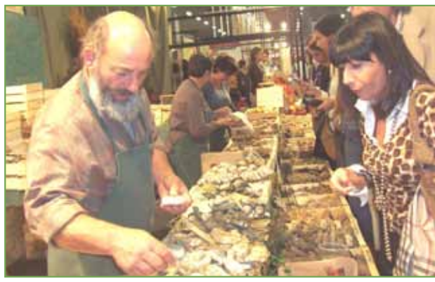
Photo of the Salone del Gusto, a trade show for food producers from across Italy and around the world.

After our busy first day, it was great to get back to our lodgings and share in a typical Italian meal. As we ate, we were looking forward to the next three days when we would be attending sessions on social programs in agriculture and food; on fair pricing; the role of research in supporting the use of sustainable practices; less meat/better meat – focusing on grass-fed meat and humane slaughter; continuing to make connections with other farmers, producers, and food activists, and, of course, more Salone del Gusto.