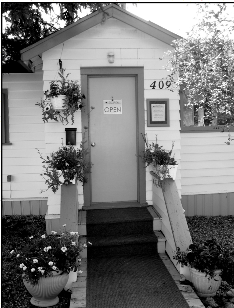
Hospice House, 409 Jarvis Street

When you consider the long hours many of us spend with our colleagues, it is little wonder when loss occurs in our workplaces, we can be powerfully affected.