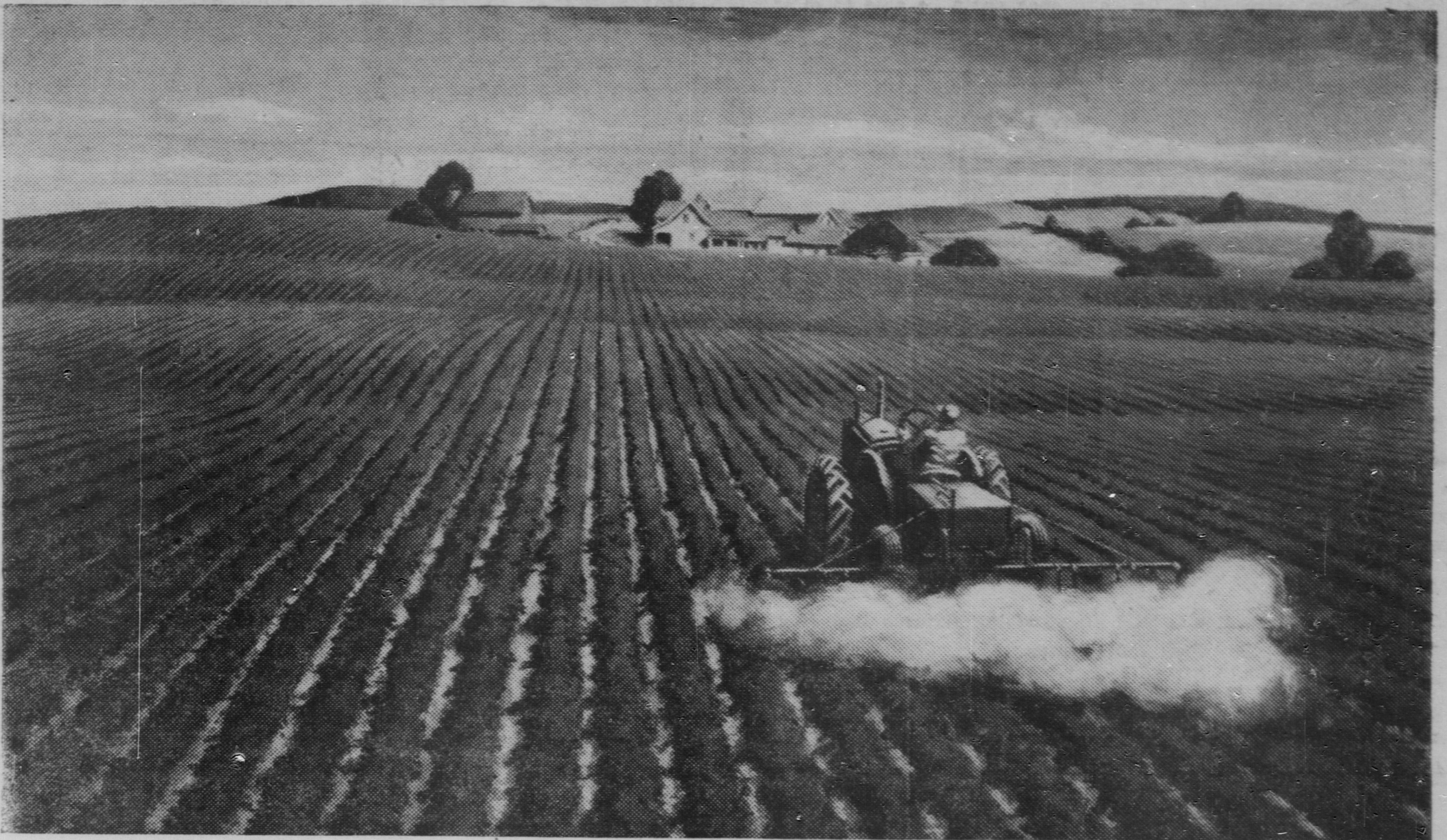
As the world's chief source of supply for seed potatoes, Canada ships millions of quality certified seed potatoes each year to replenish the world crops of one of mankind's most essential foods.