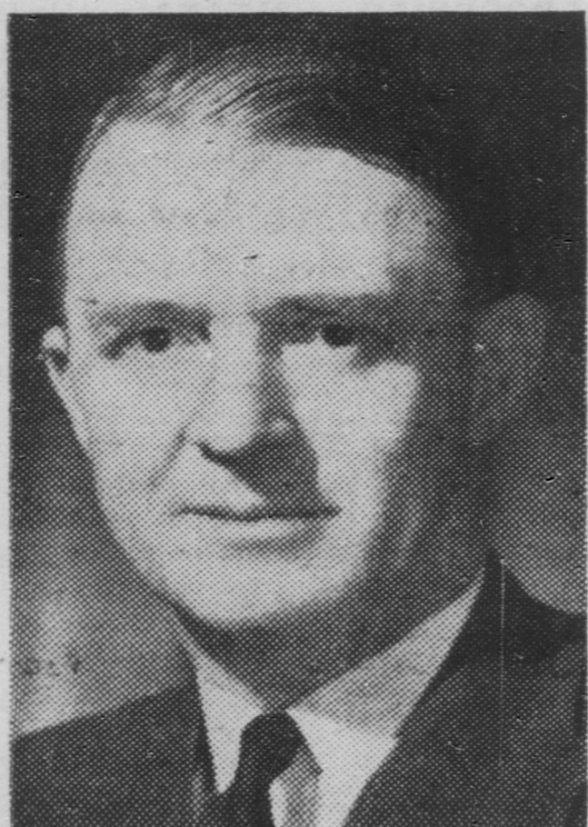
D. C. ABBOTT

OTTAWA, June 23.—Finance Minister Abbott today tabled in the Commons supplementary estimates of expenditures for 1950-51 totalling $82,451,398.