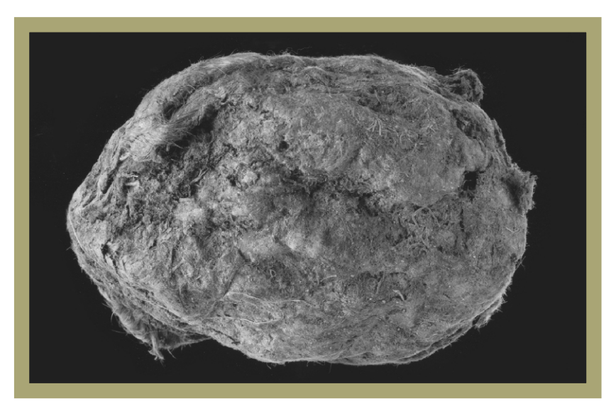
Figure 2: A. Outer appearance of the "Moon-Egg" (greater than 47,000 years old) from Glacier Creek, Yukon. Note the fine hairs on the dried skin surface.

The Arctic ground squirrel (Figure 1) is the largest and most northern of American ground squirrels. The species has a head and body length of 215 to 350 mm, a tail length of 75 to 150 mm and weighs between 530 and 850 g. It is tawny to reddish brown and flecked with white resembling the Columbian ground squirrel ( Spermophilus columbianus ) in colour. However, it differs from that species in its strongly-arched skull, wide cheek bones and long tail with its bushy black tip.