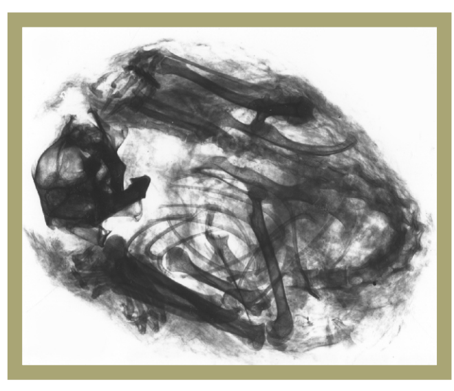
B. X-ray of the "Moon-Egg" showing the complete skeleton of an Arctic ground squirrel coiled head to tail as if it had died during hibernation.

Permafrost restricts burrowing and their tunnel systems may be spatially extensive, though confined to the zone of seasonal thaw or active layer. Hibernation dens of roughly 25cm in diameter are constructed off the main burrows about 100cm below the surface. The animals hibernate for 7-8 months a year, rolling up in balls with their backs uppermost and tails covering head and shoulders. They emerge in late April and early May. They eat a wide variety of