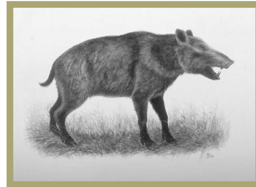
Figure 1. Restoration of an adult flat-headed peccary in defensive position. Illustration from a painting by George Teichmann.